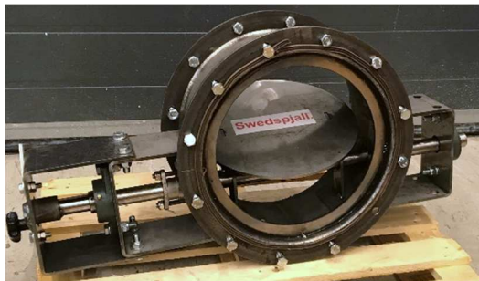
DN 400 for marine application