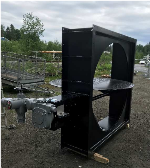
DN 1600 for paper industry