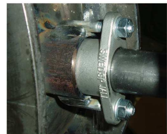
Stuffing box in SS as standard