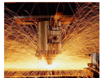
Laser cutting for high tolerances

Serie 400 has a high tightness without using an air sealing system. The mounting length is short compared to standard disc dampers, making it cost effective.