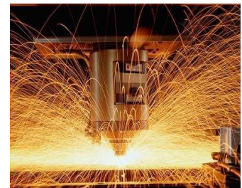
Laser cutting for high tolerances

The mounting length is short compared to standard disc dampers, making it cost effective.