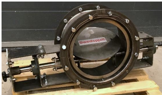
DN 400 for marine application