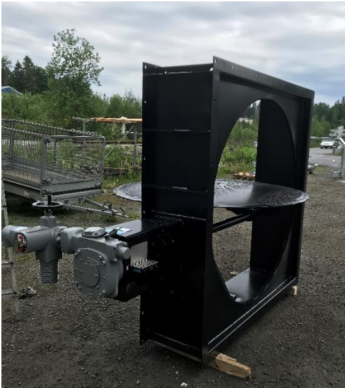
DN 1600 for paper industry